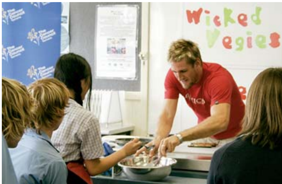
Curtis Stone, celebrity chef, promoting class food preparation and healthy eating to keen Riverside High students. Afternoon book signing 3.00-4.00pm delicacy.

Curtis' friendly style and sense of humour were a great hit with all. The principal commented that the students had found Curtis inspiring. The visit resulted in positive media with ABC radio Drive Time and a front page pointer and articles and photographs (pages 2 and 5) in The Saturday Examiner Launceston.