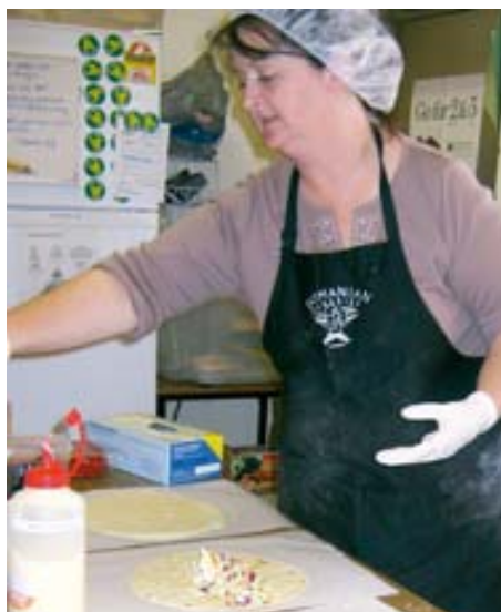
Canteen staff at Roseneath Primary preparing fruit plates and healthy wraps – being Food Safe.