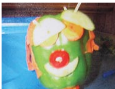
The Healthy Critters Competition