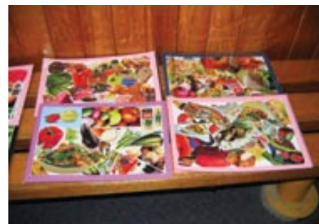
Preps Laminated Fruit & Vegie placemats