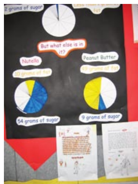
Grade 2/3 Nutella and Peanut Butter comparison